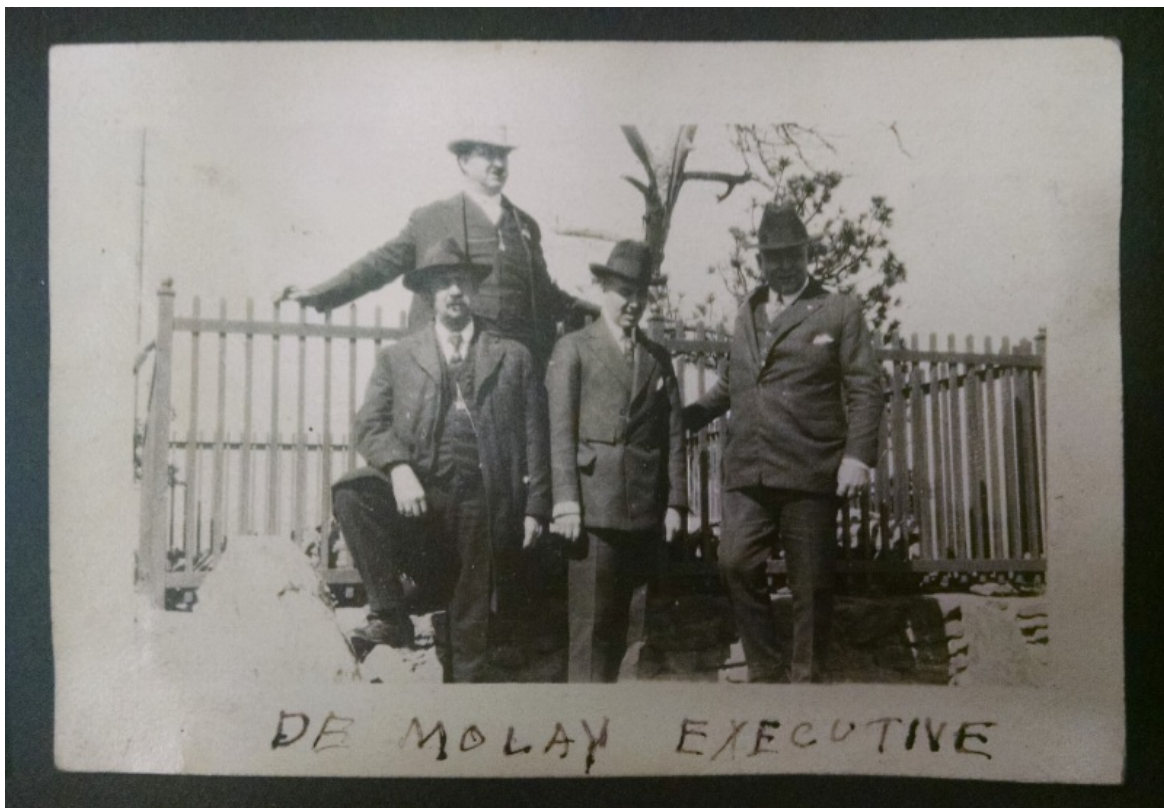
Early Masonic Support of DeMolay: